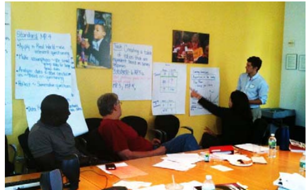
Math teachers working during a workshop session.

In these workshops, math teachers and teams will: